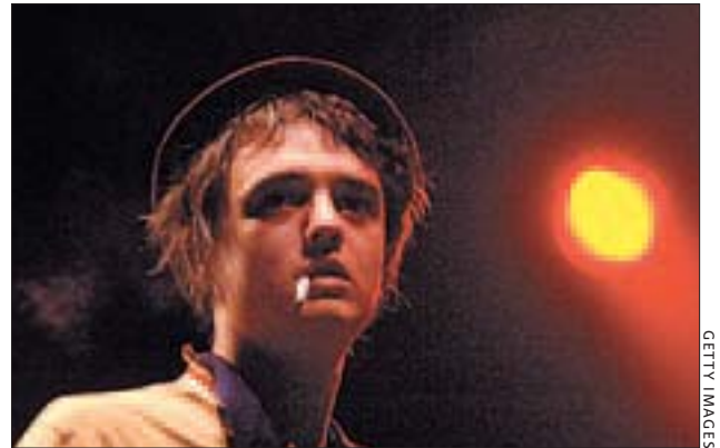
MOVE OVER, Bridget Jones. Here comes Pete Doherty.